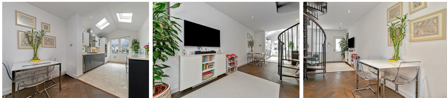
Ground Floor Approx. 31.2 sq. metres (335.8 sq. feet)

Nestled between similar character cottages is this attractive two bedroom, two reception room terraced property, located in the heart of the conservation area with views overlooking the 'Old Brickie' Park and the rare advantage of off road parking. This pretty cottage has a contemporary feel as you step inside with accommodation arranged on two floors. The ground floor comprises of an entrance porch, a 20ft lounge/diner open to the stylish fitted kitchen area. A fabulous spiral staircase leads to the first floor where the master bedroom, a further bedroom and a trendy shower room can be found. The combination of some old tradition such as xylo-herringbone wood flooring, sash style windows and custom made spiral staircase are fused with modern day luxuries including underfloor heating in some living areas, sleek Harvey Jones fitted kitchen cabinetry complemented by integrated Neff appliances and a lavish fitted C.P Hart shower suite. To the outside is a lovely low maintenance courtyard style rear garden with the rare benefit of side gated access leading to the front of the property. To the front of the property is a 'cobbled' style driveway providing off road parking for one car. New England street is an enviable address as it gives easy access to the city centre with its extensive shopping and leisure facilities and is near to the mainline railway station.